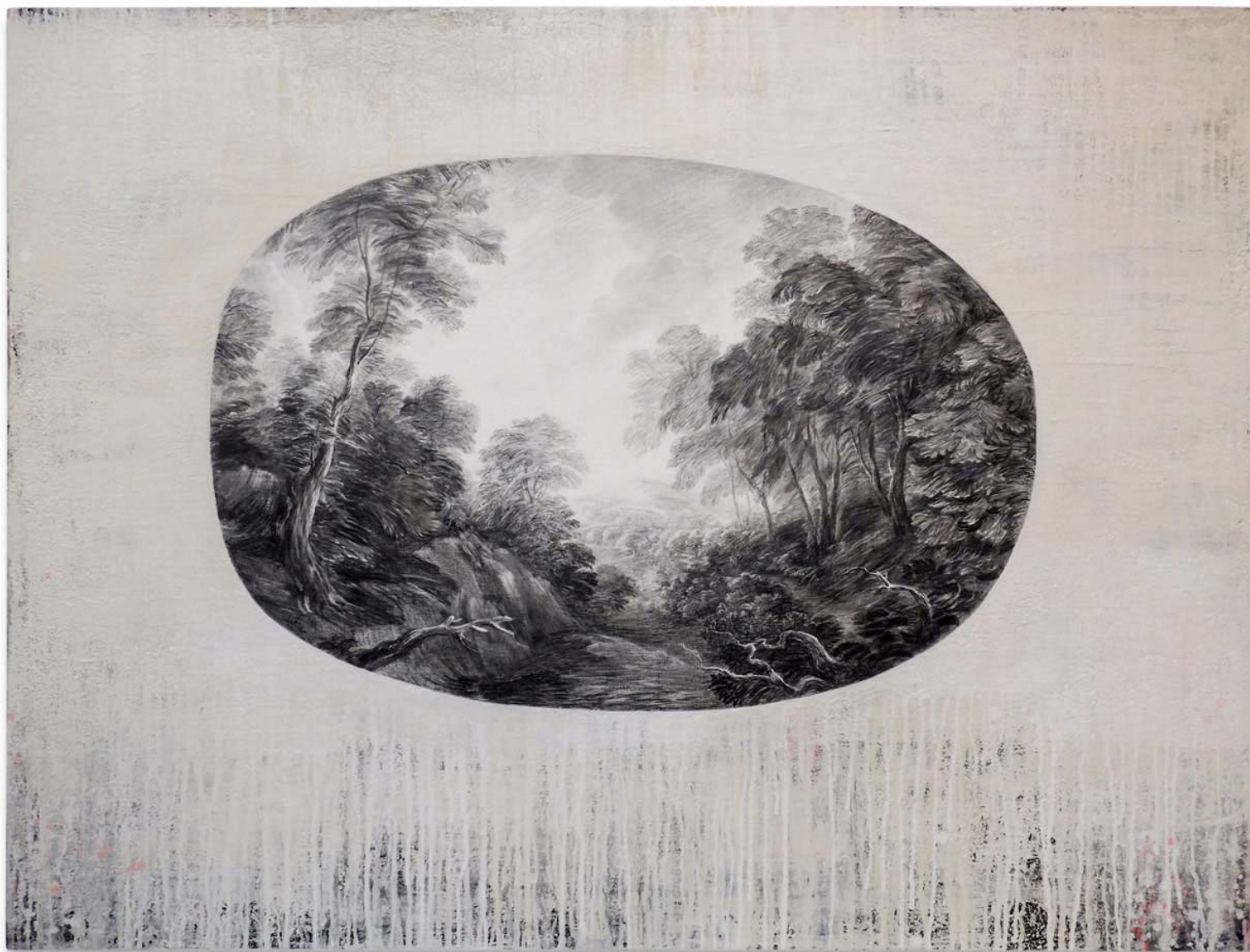
'Desire & Longing 21' Sue Williams A'Court Graphite & mixed media on canvas, 2017 120cm W x 90cm H £6200