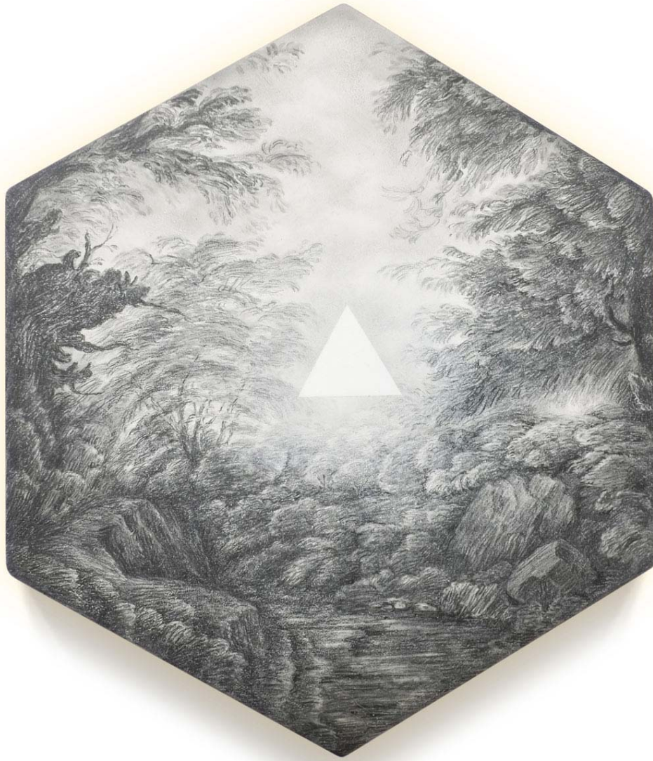
'Liminal Space Form 3' – Sue Williams A'Court Graphite & mixed media on board with gold leaf, 2014